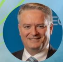
Mathias Cormann Secretary-General OECD