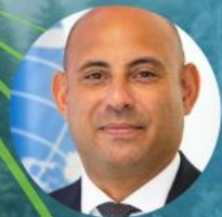
Simon Stiell Executive Secretary UNFCCC